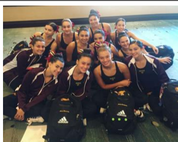
Barbara Goleman Senior High School Jewels Dance Team. Attended the National Dance Association (NDA) Summer Camp.