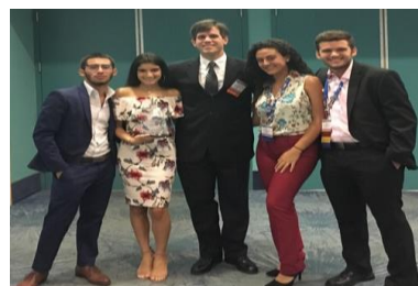
Four students from Mater Lakes Academy competed in the Future Business Leaders of American (FBLA) finals. One student place 8 th nationally.