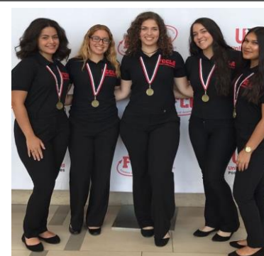
Hialeah Gardens Senior High School National Gold Medal ParliPro Team finished 1st in Region and 3rd overall in the nation at 2017 Family, Career and Community Leader of American (FCCLA) National Leadership Conference in Nashville, Tennessee.