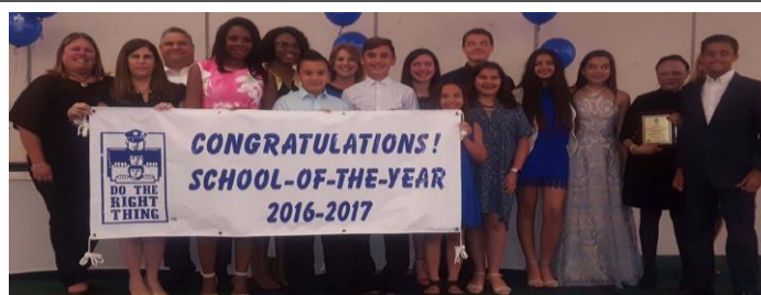
"Do The Right Thing" Miami School of the year Awards Ceremony. Congratulations Hialeah Gardens Middle School!