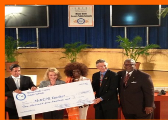
Teacher Performance Pay Recognition Ceremony Held April 15, 2013 In The School Board Administration Building Auditorium