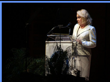
School Board Chair addressing the audience at The Superintendent's Opening of Schools Address which took place on Friday, August 10, 2012, at the Adrienne Arsht Center for the Performing Arts of Miami-Dade County.