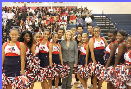
"No Texting & Driving" Pledge Rally American Senior High School September 19, 2012