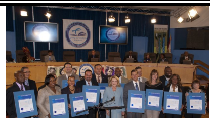
Members of the Miami-Dade County Legislative Delegation being recognized for their support of Miami-Dade County Public Schools during the 2012 Legislative Session.