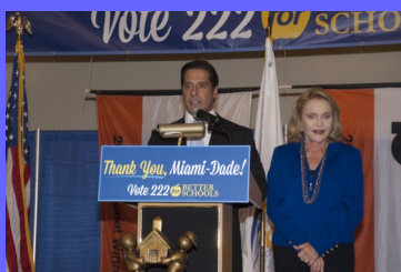
Election Watch Party at Miami Senior High School

The Bonds will help enhance the safety and security of school buildings; renovate or upgrade every school; guarantee technology equity across all schools; seek stakeholder input while minimizing the burden to taxpayers; promote greater public/private partnerships; provide economic development and employment opportunities to our community; and provide transparency and confidence with citizen advisory and oversight committees to ensure timely and equitable distribution of projects.