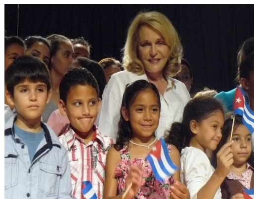
School Board Chair joins a group of participating students.